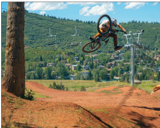
Race against friends and family in this series of 4 downhill mountain bike races throughout the summer, open to riders ages 7 and up.

25 Woodward Summer Race Series Jun 25 Woodward woodwardparkcity.com