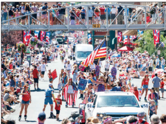
One of the best days of the year in Park City! 7 am Pancake Breakfast 8 am 5K Fun Run 11 am Parade on Main Street Noon+ Afternoon Celebration in City Park 9 pm Drone Show at Park City Mountain Resort

4 Fourth of July Jul 4 435-649-6100 | visitparkcity.com