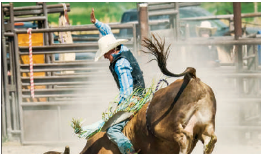
The 87th Annual Oakley Rodeo is a four-day, Professional Rodeo, Cowboy Association sanctioned event. Featuring buckin' broncos, raring bulls, cowboys, cowgirls and rodeo queens — making this a true Western-rooted celebration. This year's new event on July 7th is called Xtreme Bulls!

2-5 89th Oakley Rodeo and Celebration Jul 2 – 5 Oakley Rodeo Grounds