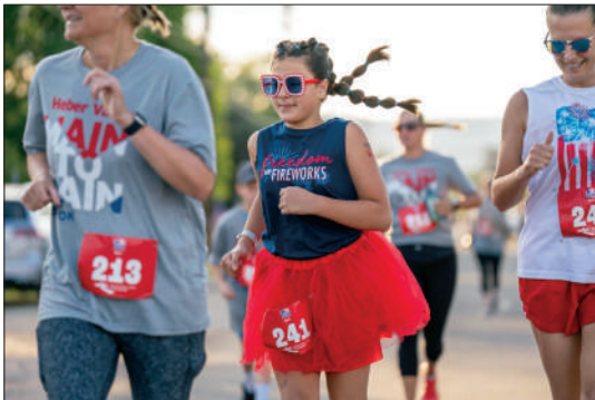
Start the morning at Heber's Main Street Park with a 5K or 10K race. Then patriotic walk participants will show off their red, white and blue outfits, waving American Flags to the chuckwagon breakfast. Join the cornhole tournament, a sidewalk chalk art contest, strong man contest and market with local vendors selling food and crafts. As the evening approaches, enjoy an outdoor concert with patriot tunes and other popular songs, followed with a giant fireworks display on Memorial Hill.

4 Red, White and Blue Festival Jul 4, 6:30 am – 10 pm Heber City 435-654-3666 | gohebertvalley.com